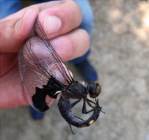
Figure 1. A female Black Saddlebags, my first catch

I would be remiss to not explain why I undertook this project. Odonates, or dragon and damselflies, form unique keystone predators. They begin their lives underwater as a nymph. During this time they look like true alien creatures, with each having six spiny legs, a water-propelling abdomen, and a xenomorph-like jaw that can detach and grab prey. After a few years, this creature gets bored, climbs the nearest plant, and transforms into the aerial fly we all know today. Each species is a different shape and color, ranging from ocean blue to ruby red, with everything in between. Each species has a specific role in the ecosystem, meaning that knowing what kind of dragonflies are in an area can tell researchers what is going on there. That's where I came in. On every sunny day, I would go out and try to catch as many Odonates as possible, with the goal of meeting all the different members flying around. We caught over forty kinds, with twelve county species records- not bad! But this is too much science--you came for the stories, of which I will share a few.