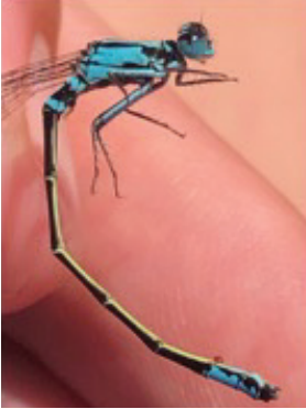
Figure 2. The critically imperiled Lily-pad Forktail. Notice how small it was!

got the feeling you weren't in your own world anymore, as you floated among a mystic ceremony few would observe in a body of water few would ever traverse. After capture, we identified this bug as the Lily-pad Forktail, a critically endangered damselfly. In fact, our guidebooks hadn't even listed it as living past Harrisburg, making this experience even more magical.