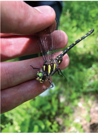
Figure 3. The incredible Twin-spot Spiketail

At this point the dragon got squeamish and picked up speed, breaking the air at what seemed like Mach 3. I'm the only one left, and it's headed straight for me. "This is it--swing!" I gave it all I had, torquing out the net like my life depended on it. In the blink of an eye, the dragon collided with the metal rim of my net, knocking itself off kilter. Like a wounded fighter jet, it tail-spun towards the ground, slamming into the water as I yelped in victory. I went to scoop up my waterlogged prize.... only to fall straight face forward into the creek! In all the intensity and focus my boot had become submerged in the muddy creek bottom, trapping me in a moment of hubris. Both the dragon and I recovered in the next second, with the former flying into a nearby tree and I left cursing my bad luck!